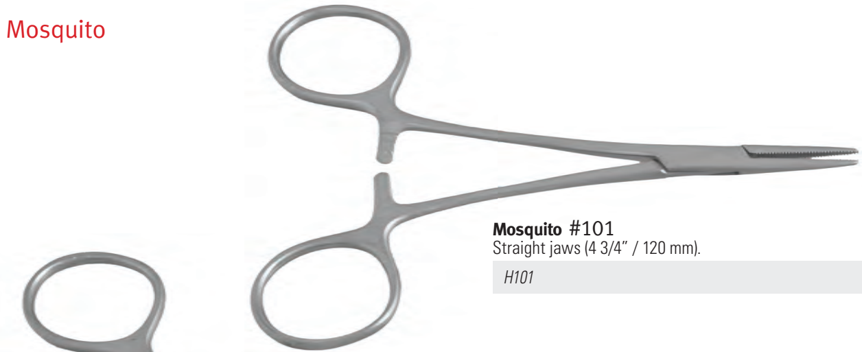
Mosquito #101 Straight jaws (4 3/4" / 120 mm).