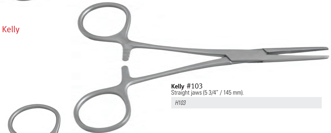
Kelly #103 Straight jaws (5 3/4" / 145 mm).