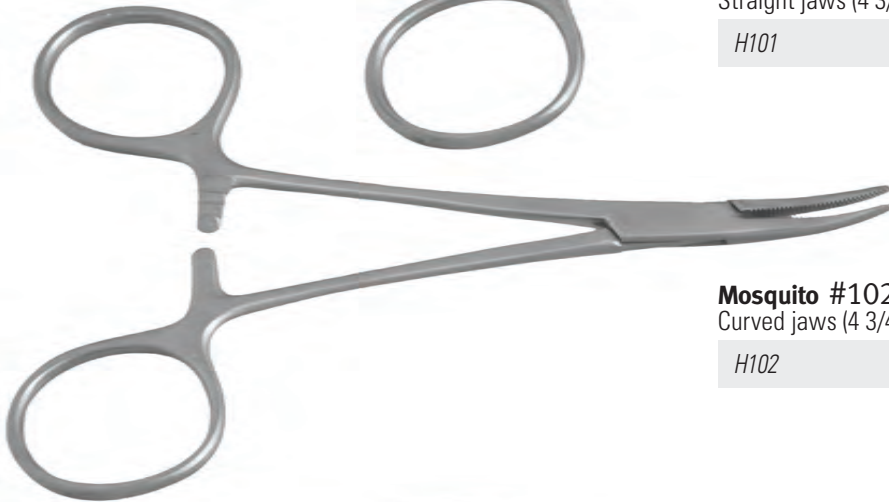
Mosquito #102 Curved jaws (4 3/4" / 120 mm).