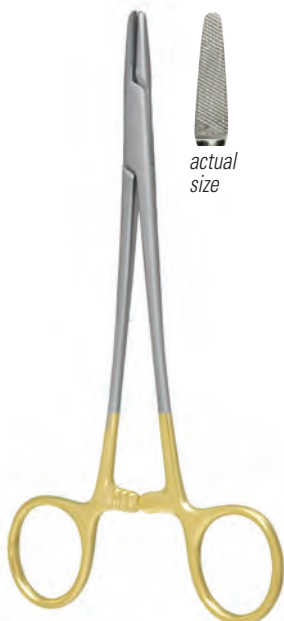
Mayo-Hegar #201 Large jaws with carbide inserts and fine serrations (6 1/2" / 160 mm).