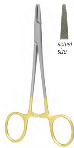
Derf #205 Medium jaws with carbide inserts and fine serrations (5" / 130 mm).