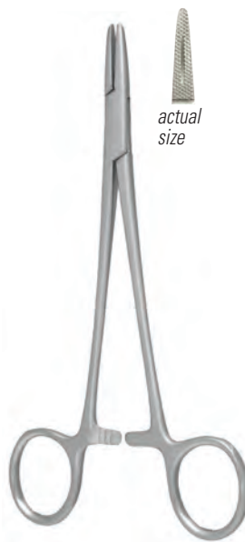
Crile-Wood #204 Medium jaws with fine serrations (6" / 150 mm).