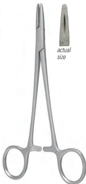
Mayo-Hegar #202 Large jaws with fine serrations (6 1/2" / 160 mm).