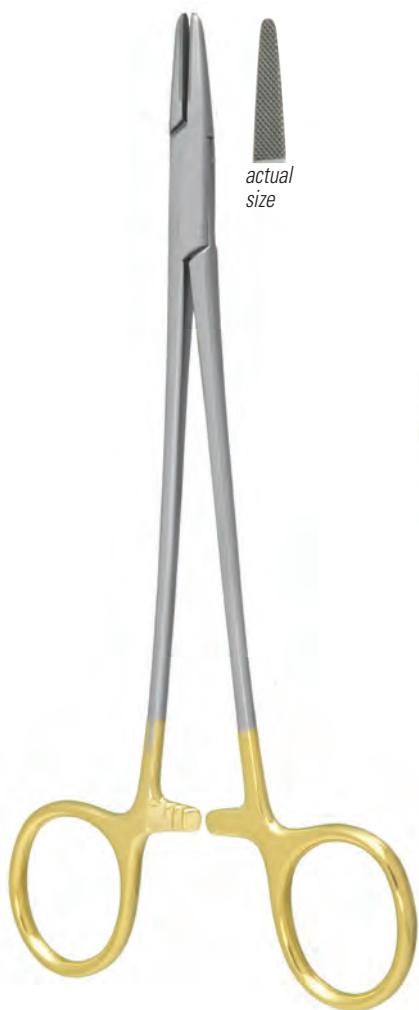
Mayo-Hegar #213 Large jaws with carbide inserts and fine serrations (7" / 180 mm).