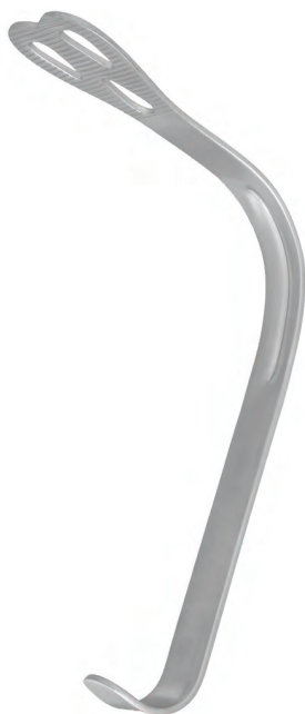
Weider #28 28 mm wide "Sweetheart" retractor. (5 1/4" / 135 mm)