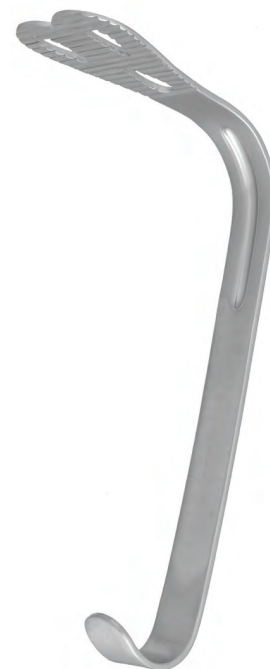
Weider #36 36 mm wide "Sweetheart" retractor. (5 3/4" / 145 mm)