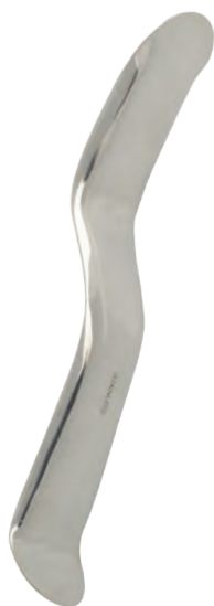
University of Minnesota (5 3/4" / 145 mm)

Used for retracting cheek and tongue during surgical procedures. All stainless steel and can be sterilized by any method.