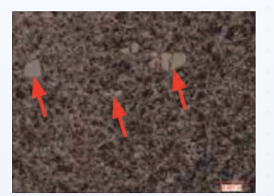
Leading sharpen-less scaler

UltraSteel Technology Scalers & Curettes