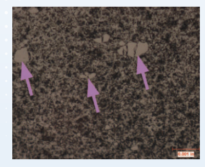
Leading sharpen-less scaler