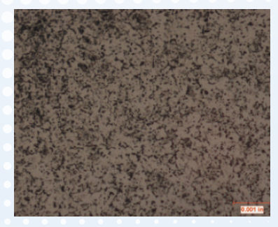
XDURA Scalers & Curettes

Our products' superior strength comes from the uniform distribution of carbide particles. See the difference with these 500x magnified SEM images.