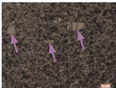
Leading sharpen-less scaler