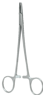
Needle Holder, Stainless Steel, Crile-Wood #204 (6" / 150 mm)