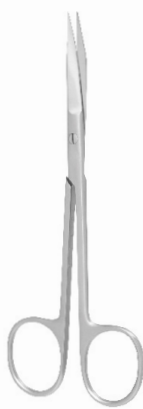
Scissors, 1 Blade Serrated, Goldman Fox (5" / 130 mm)