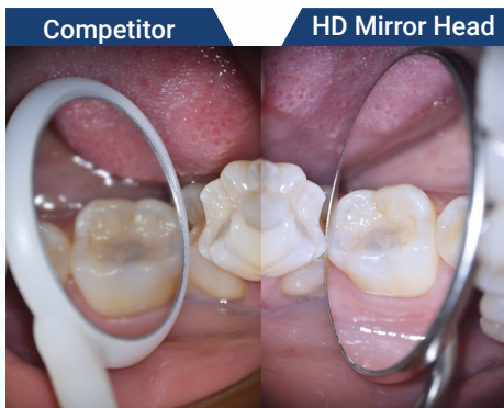
No double image – Image reflected directly on the glass

100% level of color reflection with zero image distortion, providing accurate and clear visuals during procedures.