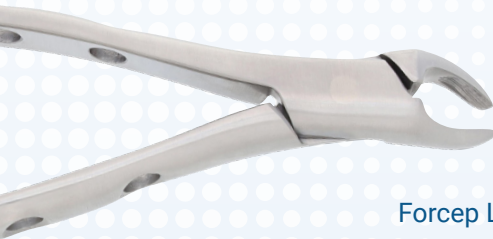
Forcep Upper Child, English